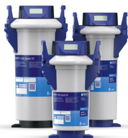
PURITY Quell ST