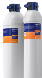
PURITY C Steam