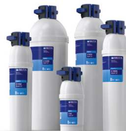
PURITY C Quell ST