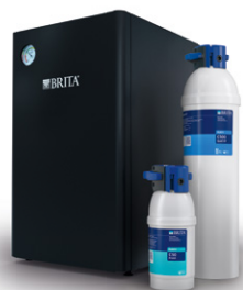
BRITA PROGUARD Coffee