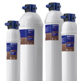
PURITY C Finest